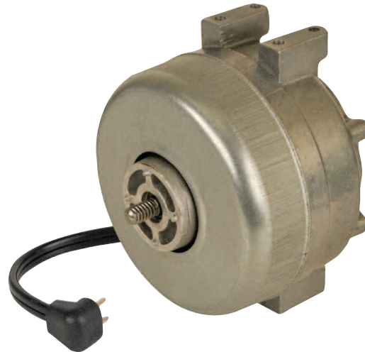
Dual Pad Mounting Lyall Plug