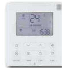
Optional Wired Programmable Controller 17317100001195

2 Oil traps should be installed every 16.5 to 23 feet (5-7m) when the outdoor unit is installed above the indoor unit